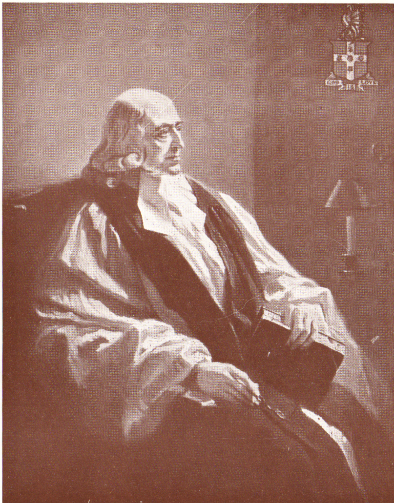
JOHN WESLEY — Evangelist

"O that the world might taste and see The riches of His grace! The arms of love that compass me Would all mankind embrace"